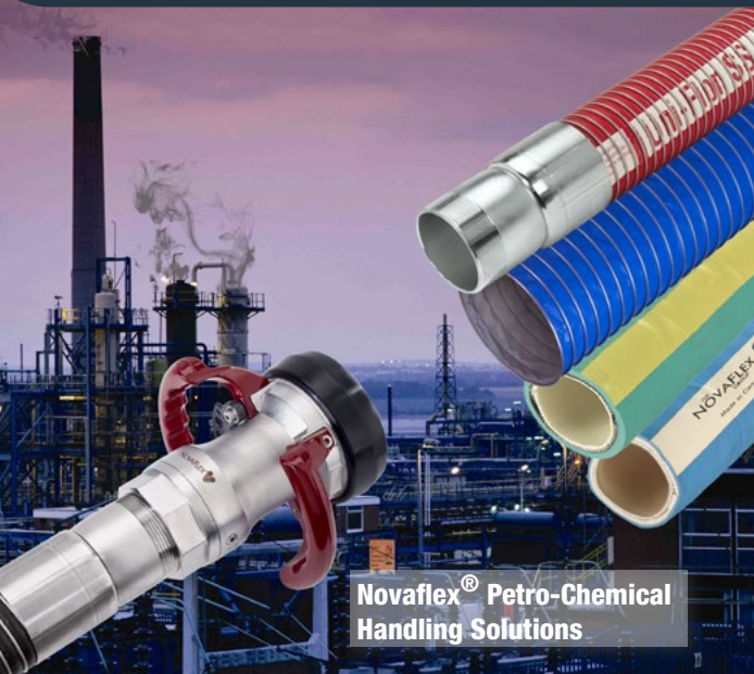
Novaflex® Petro-Chemical Handling Solutions

Novaflex® offers the most comprehensive petrochemical, liquid, vapor & fume transfer solutions, chemical fume extraction duct, petrochemical transfer hose systems, HDC® dry disconnect couplings