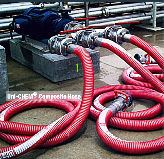
Uni-CHEM® Composite Hose

Novaflex® offers the most comprehensive petrochemical, liquid, vapor & fume transfer solutions, chemical fume extraction duct, petrochemical transfer hose systems, HDC® dry disconnect couplings